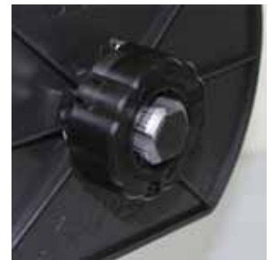
Easy assembly lock module for quickly and firmly label roll holding