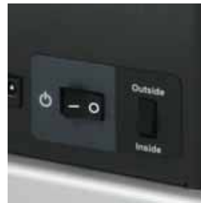
Rewinding direction switch to rewind "inside or outside" label rolls